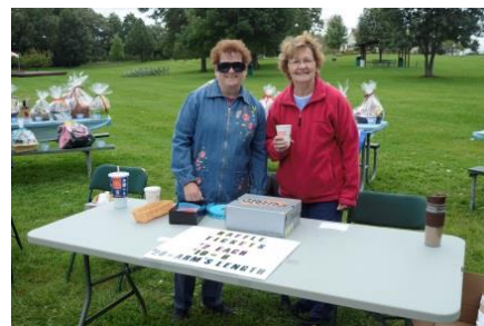
Thanks for Standing Up for our Kids!

So, thank you volunteers for playing such an important role in helping all AHC children and adults have a chance for a better life and eventually ending AHC!