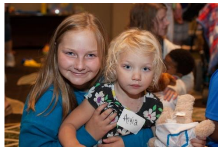
Thanks Volunteers of All Ages!

Volunteers start early as siblings, cousins and friends. Others join our ranks as parents, aunts, uncles, and grandparents. And still more come to us as someone who loves an AHC child. No matter the age, they all give the ultimate precious gift to our foundation, their time.