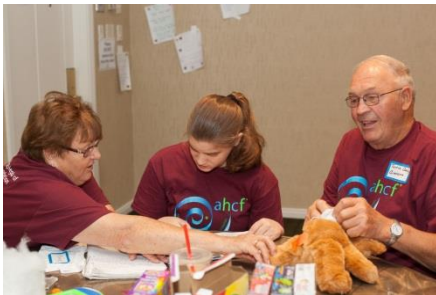
Thanks Family Meeting Volunteers!