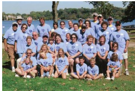
Thanks Fundraising Volunteers!

And they don't stop there. They engage, connect and inspire others to get involved too.