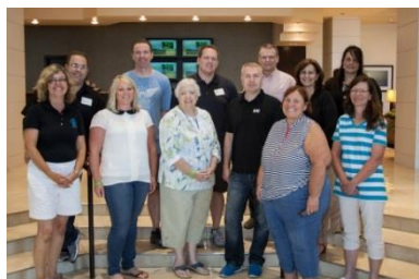
AHCF and international volunteers lead AHC efforts

If you are interested in volunteering your time to help raise awareness for AHC and fund research to end AHC, than the Board of Directors would love to hear from you.